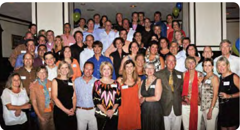
More than 50 members of the Class of 1980 partied at the SACC.

The Class of 1980 celebrated its 30th reunion on Sept. 10-11. The reunion started with a tailgate party Friday night before the football game. Approximately 90 classmates and their guests enjoyed food, drinks and catching up before the football game. Saturday night, the class had a party at the San Antonio Country Club and enjoyed good food and the music of the Lost Mule Band. The band members have been together for over 30 years and is made up primarily of fellow classmates.